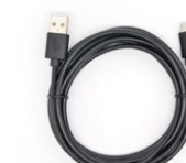
Micro USB cable (3 m) AC899-01

* We recommend using a dedicated charger (AM15-CH) or other according to the recommended parameters - 5V / 0,5A. Using a charger with other parameters may have a negative impact on the motor battery life. Damage resulting from improper engine charging is not subject to warranty claim.