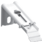
A2 Wall bracket

Extra slat weight: 127 mm slat - 0,15 EUR/pc , 89 mm slat - 0,13 EUR/pc. Extra connecting ball chain (127, 89 mm slats) - 0,26 EUR/pc.