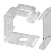
type C (clear/white)