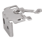
type A - universal (standard)