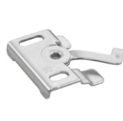
type B - ceiling