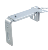
type D - adjustable 80/120 (zinc coated/colour)